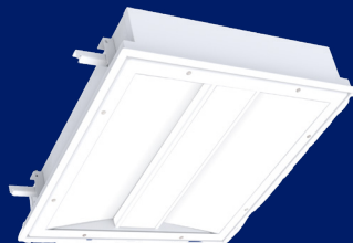
Focus / Cleanup Mode