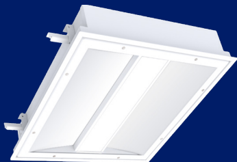
Ambient Light Mode